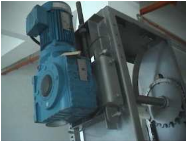
Gear Motor and overload device position