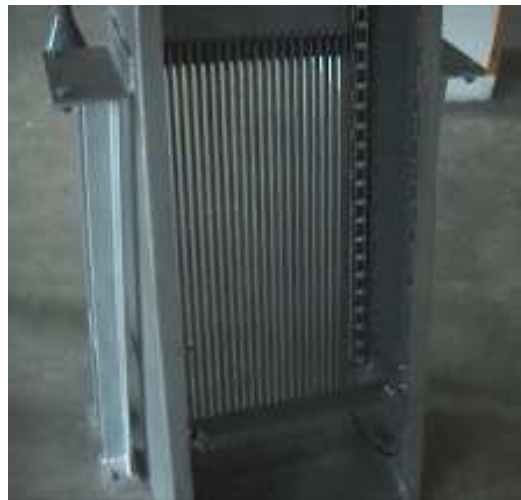
Raking operation test