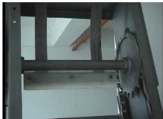
The wiper discharging screenings