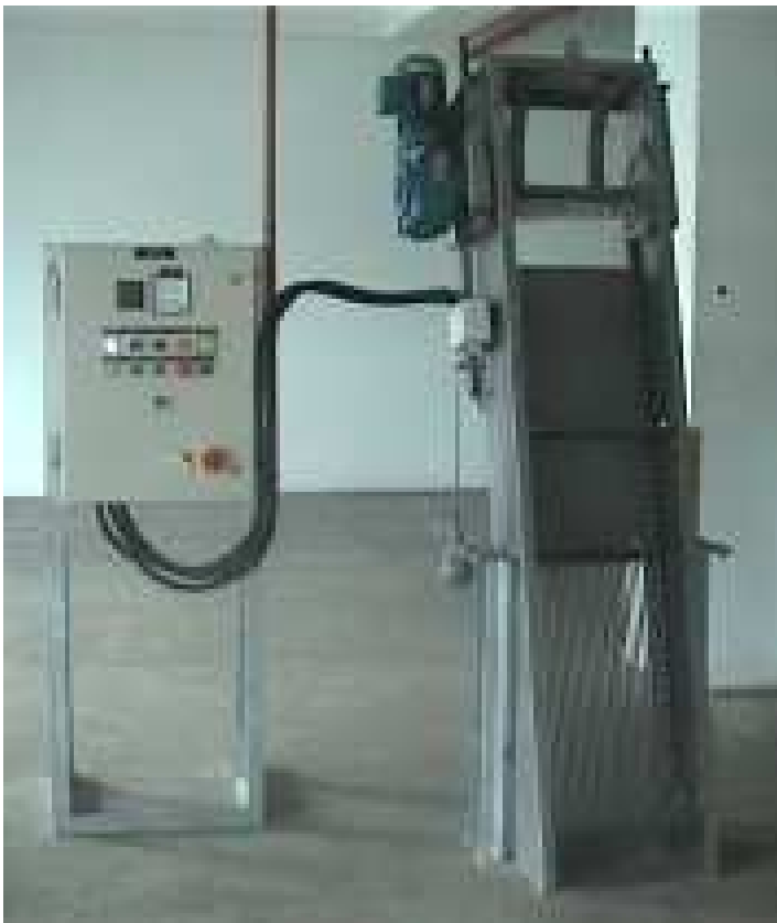
Full scale testing of Chain Rake Screen

Sam McCoy Chain Rake screen, type CR is a compelling solution for the wastewater industry. It was designed from ground up to deliver reliable performance at a competitive value. The inclination of the screen is 75 Degree. CR screen is available with two standard clear spacing between bars of 12mm or 25mm. These are suitable for primary and secondary screening.